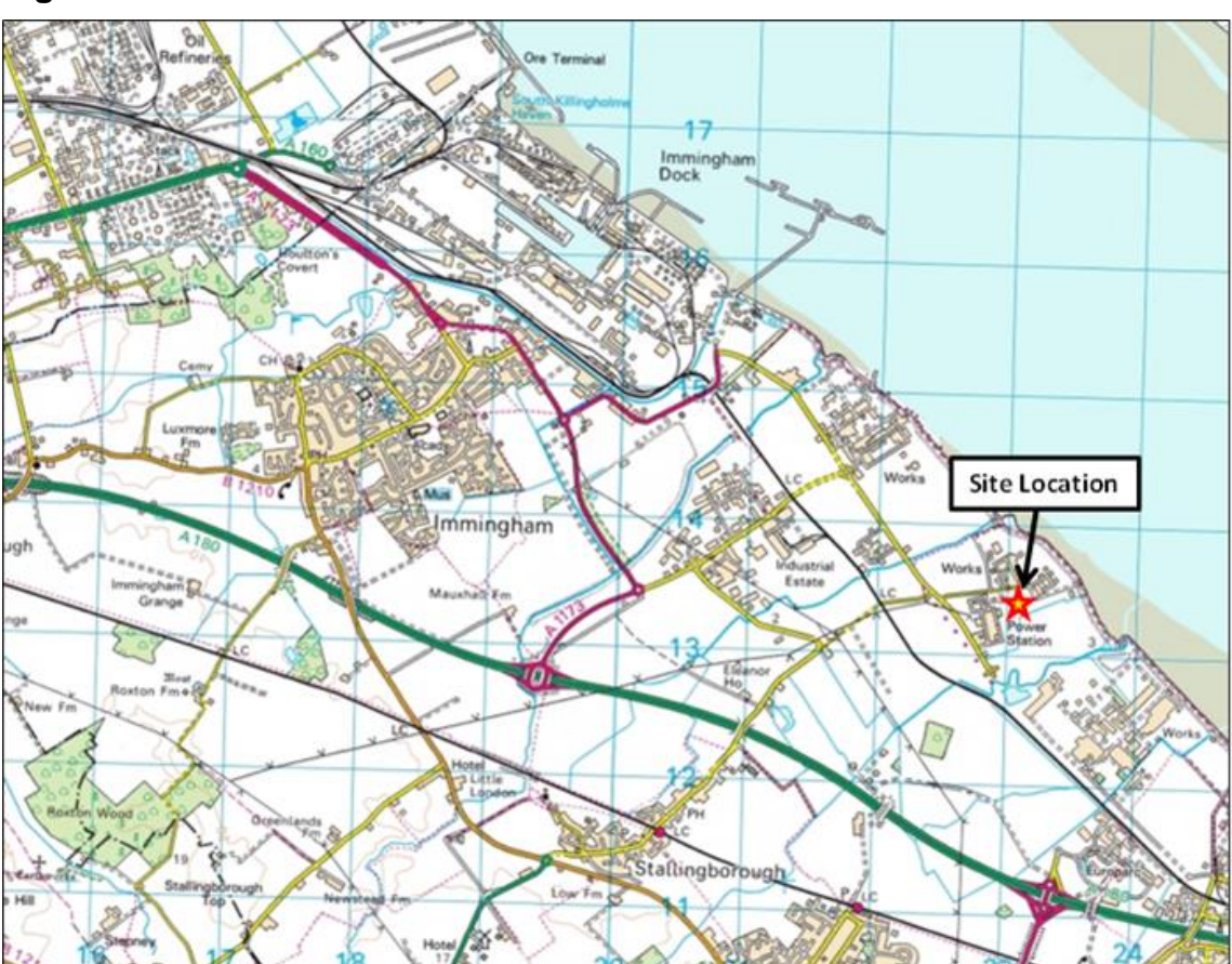
Figure 2.1: Site location